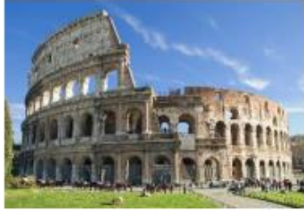
The Colosseum in Rome